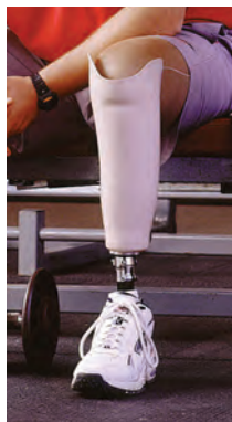
Transtibial PTB socket with locking pin suspension