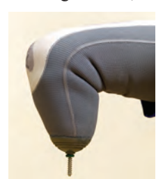
Alpha® Hybrid transtibial locking liner

Roll-on suspension liners can overcome most of these obstacles, protecting the residual limb from shear forces, providing an easier donning method, and compensating for irregular skin contours.