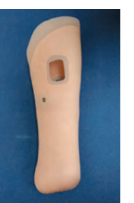
Wrist disarticulation inner socket