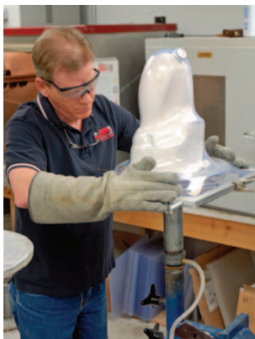
Forming the check socket.

John's socket began with layers of carbon fiber and fiberglass fabric chosen by the prosthetist to achieve desired strength and rigidity. These reinforcing materials were