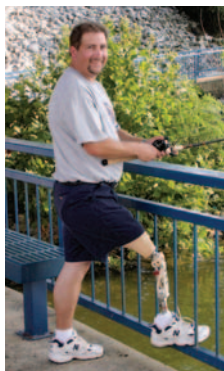
Entegra hydraulic knee

For such amputees, a key determinant of success is the prosthetic team’s ability to provide an appropriate knee component to match the patient’s age, state of health, activity level and mental acuity. Knee selection involves consideration of many attributes: biomechanical performance, energy requirements, safety, ease of maintenance, cost, and operational complexity, among others. The knowledge and experience of the prosthetist are vital to getting the knee choice right.