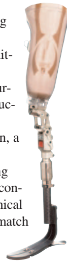
Above-knee prosthetic limb incorporating Total Knee polycentric unit with hydraulic control and stance lock

Locking systems. Some amputees require or desire the added security of a knee that locks in extension to prevent buckling. The manual locking knee incorporates an automatic positive lock that can be unlocked voluntarily. Ambulation is possible with the lock either engaged or disengaged, though