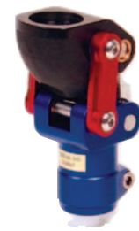
MightyMite® 4-bar knee for geriatric and pediatric patients

Another locking approach is the weight-actuated stance-control knee, originally known as the "safety knee." This unit functions as a constant-friction knee during leg swing but is held in extension by a braking mechanism as weight is applied during stance phase.